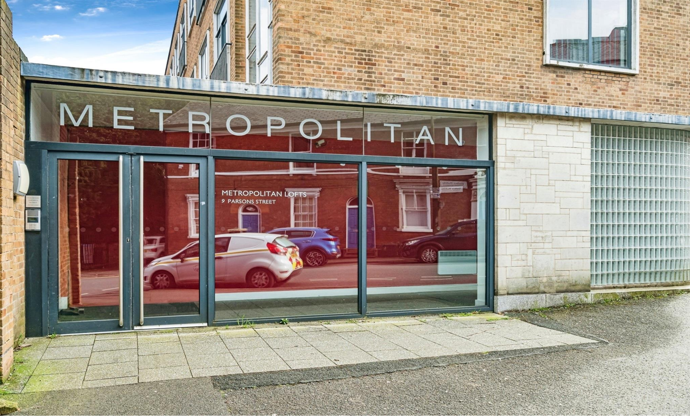
Metropolitan Lofts, Parsons Street, Dudley, DY1 1JE