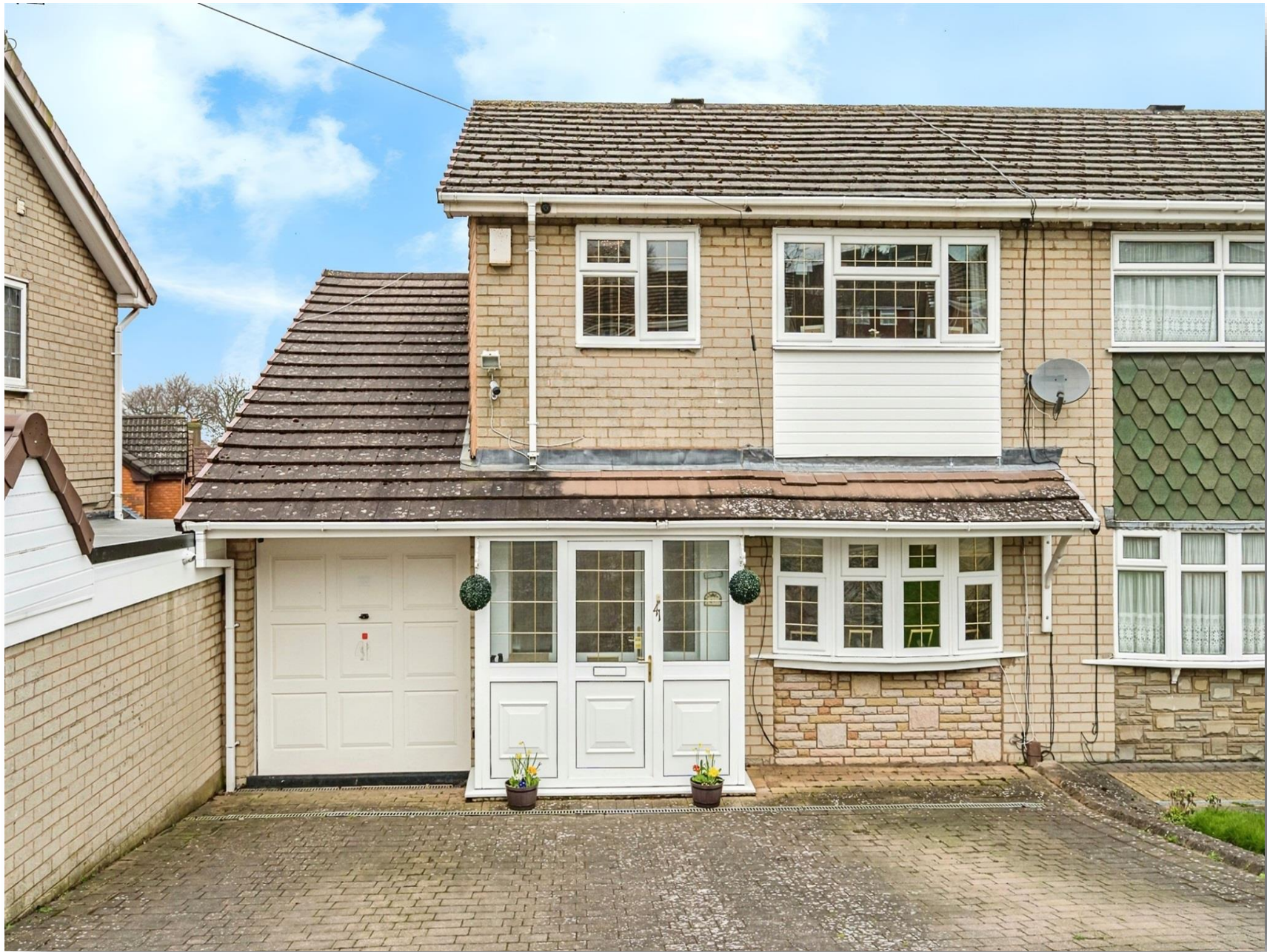
Thornleigh, Dudley, DY3 2JA