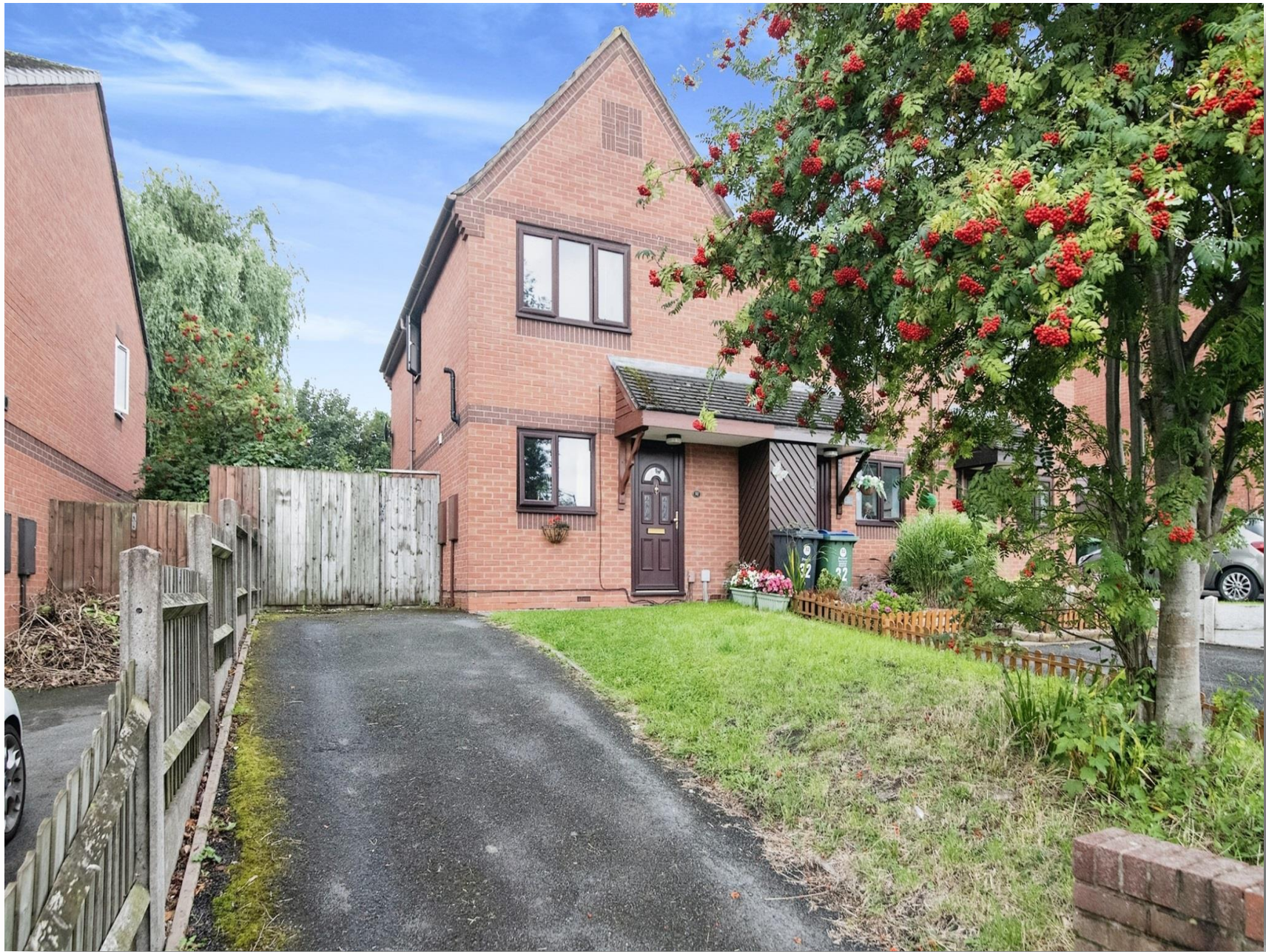
Tividale Street, Tipton, DY4 7SB