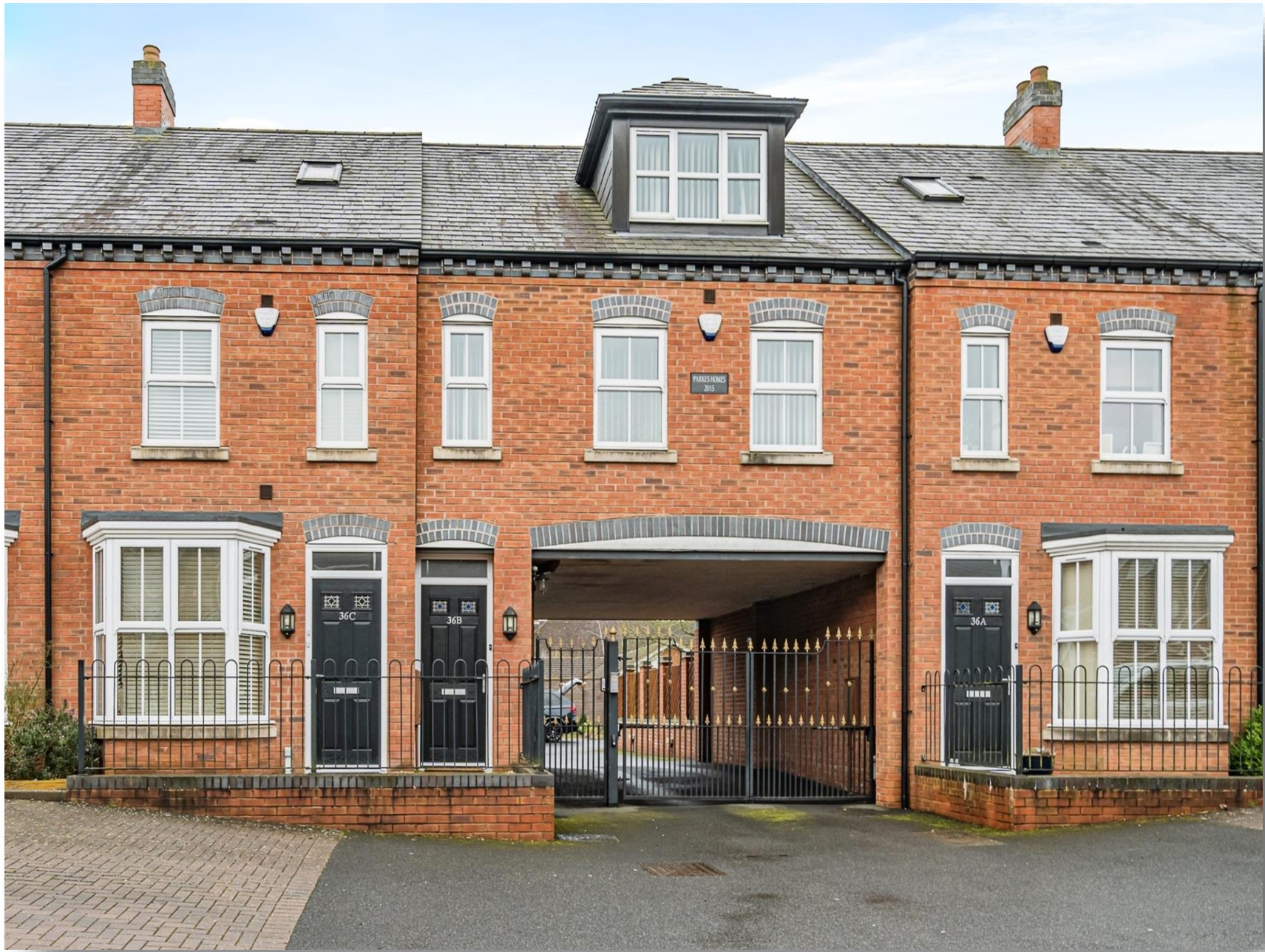
Bilston Street, Dudley DY3 1JB