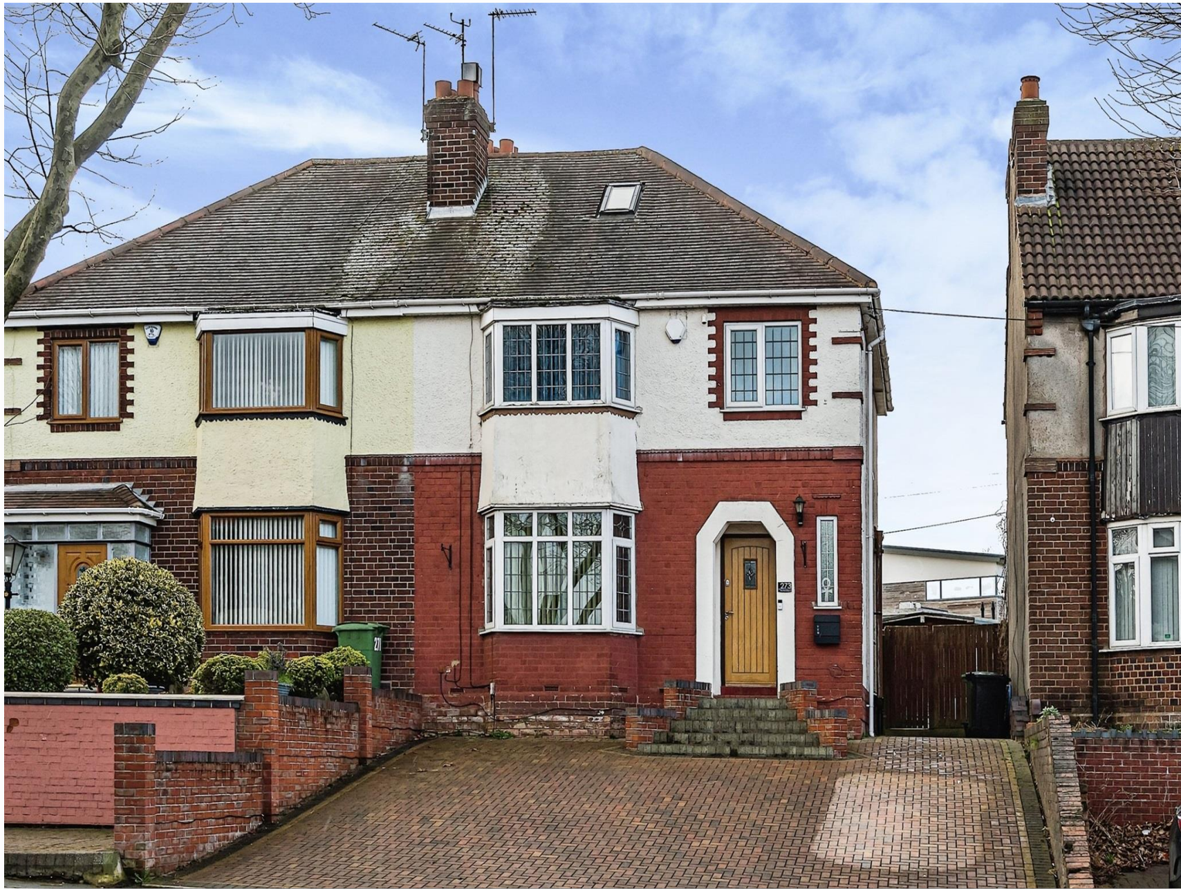
The Broadway, Dudley DY1 3DP