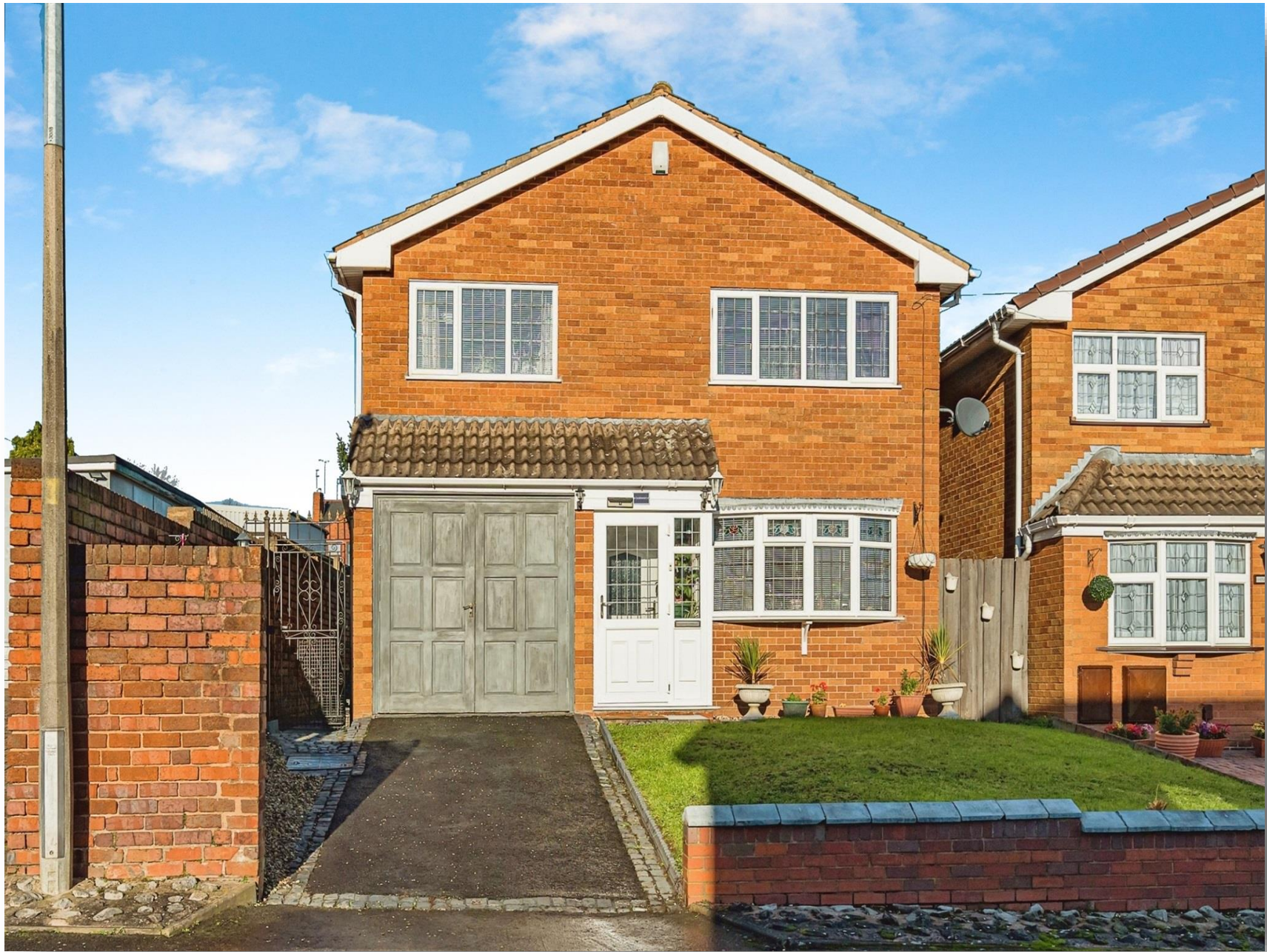
Birch Terrace, Dudley, DY2 0LJ