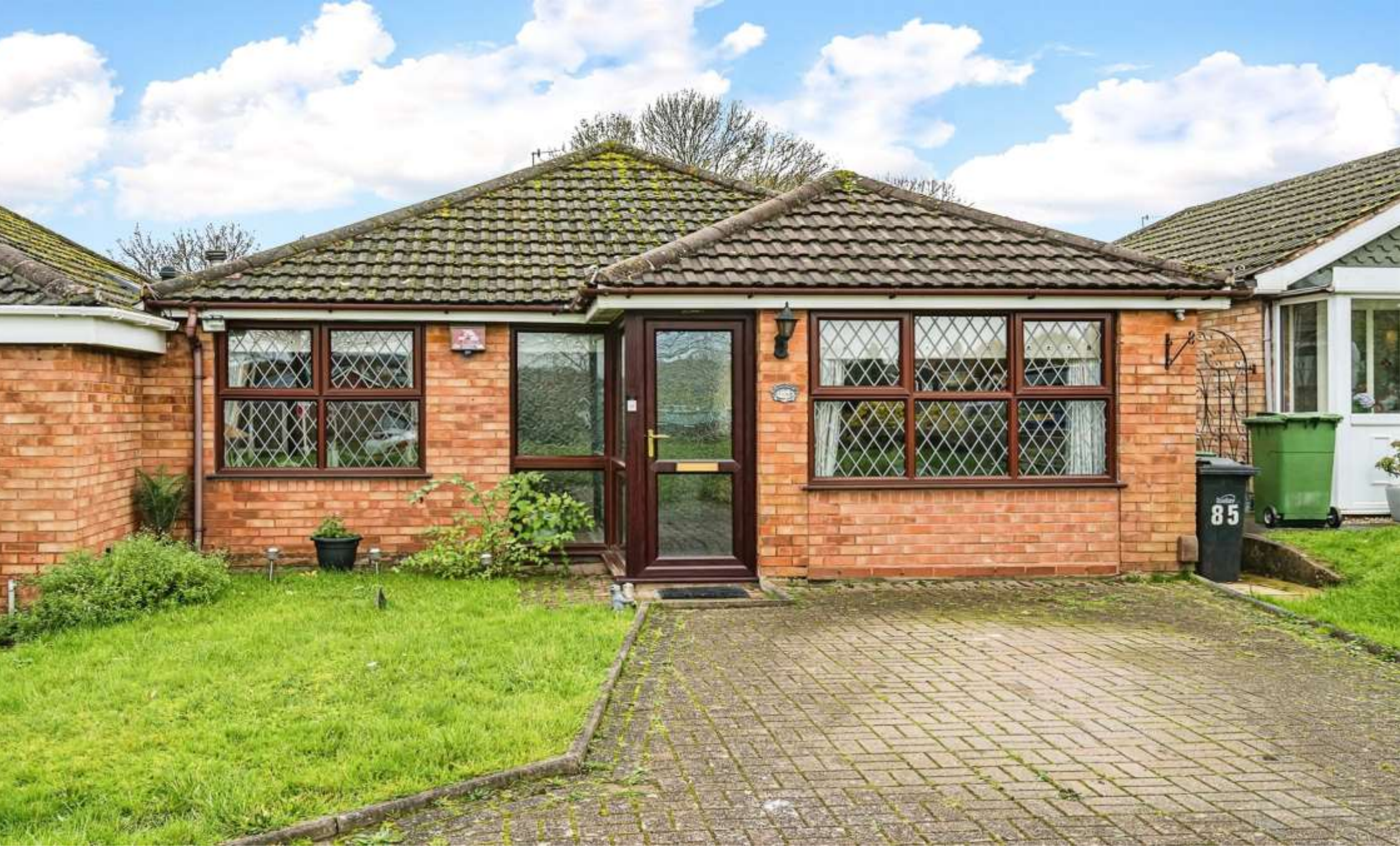
Woods Lane, Brierley Hill DY5 2RA