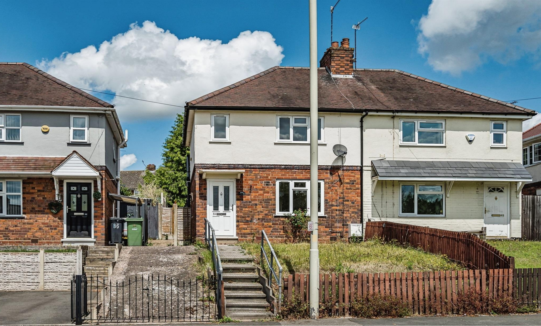
Bryce Road, Brierley Hill DY5 4ND