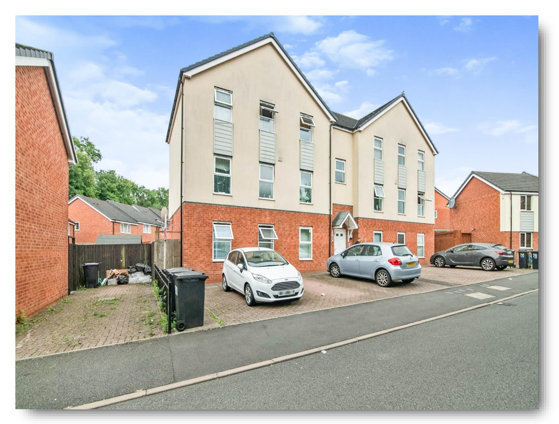
Bradfield Way, Dudley DY1 4FB