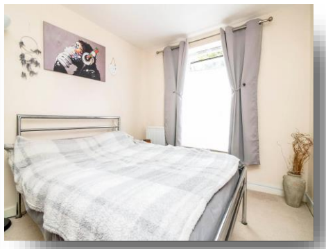
view this property online shipways.co.uk/Property/DLY103813