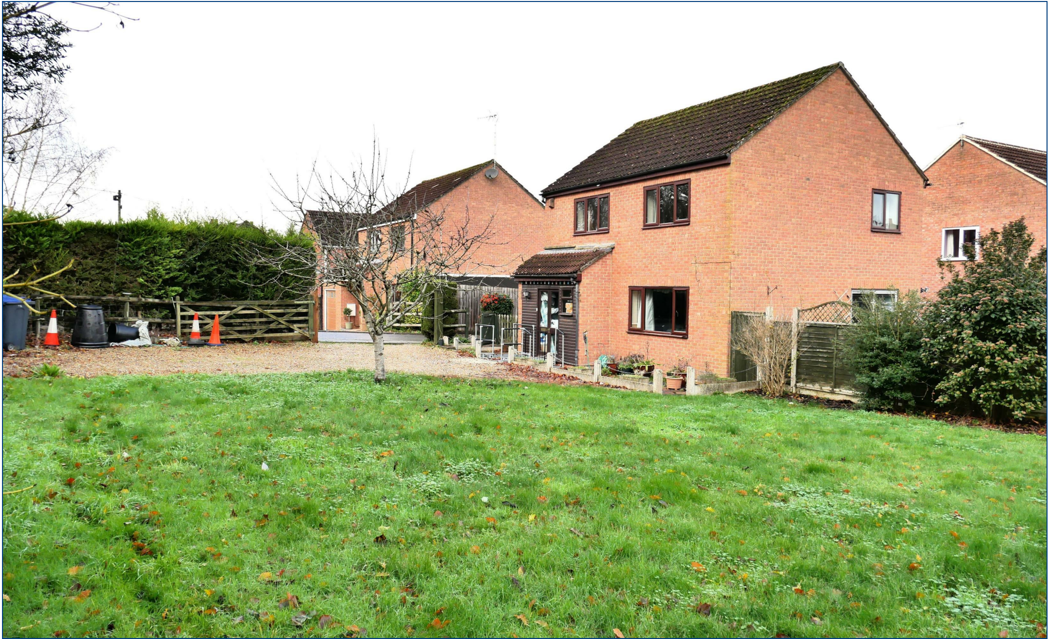
Fir Grove, Calne £399,950