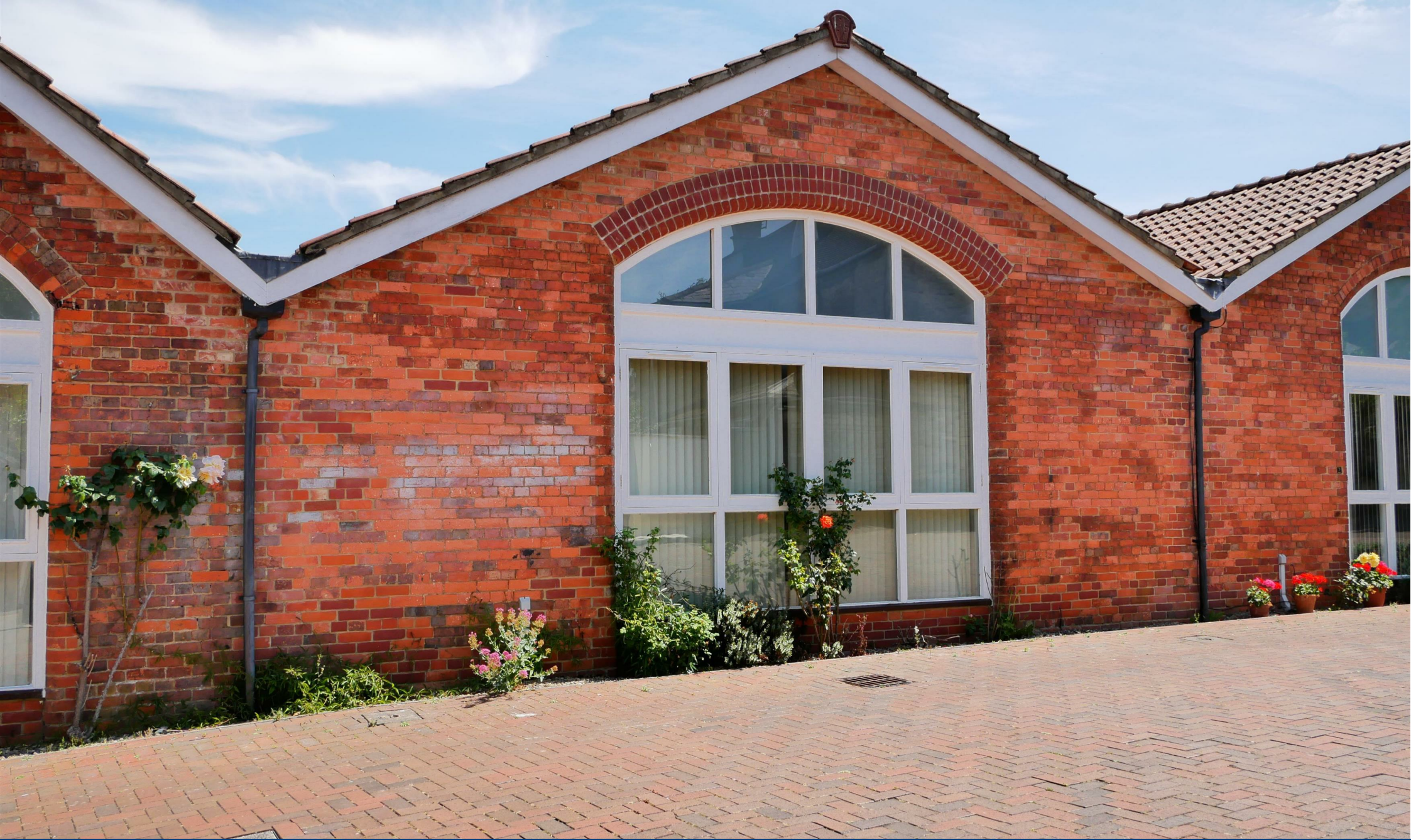
Edreds Court, Calne £285,000