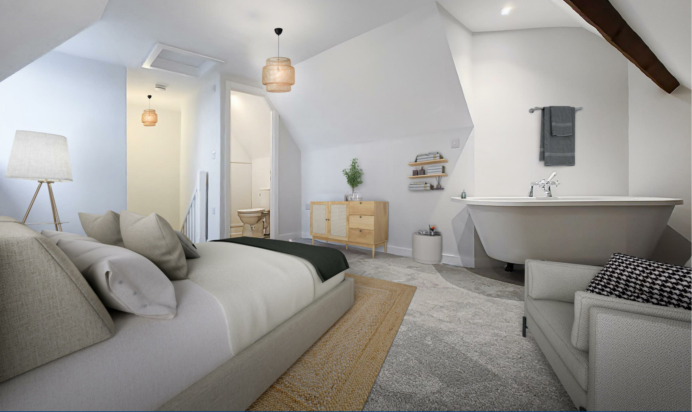
White Hart Mews, Calne £357,500