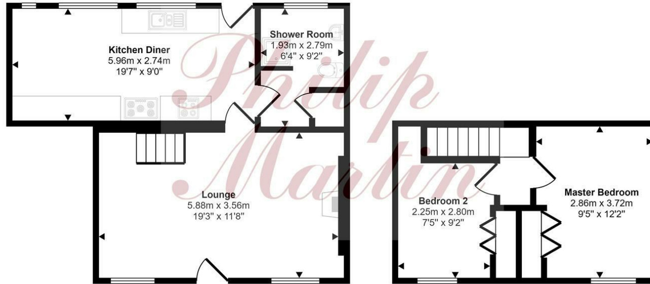
Ground Floor Approx 45 sq m / 484 sq ft