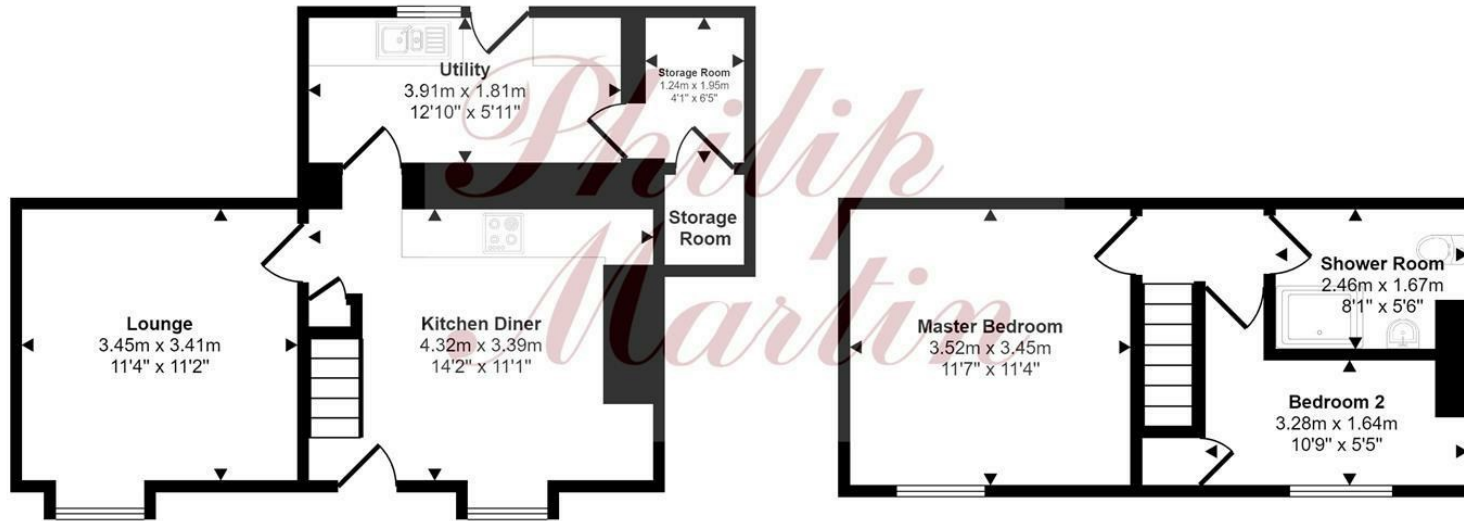
Ground Floor Approx 42 sq m / 454 sq ft