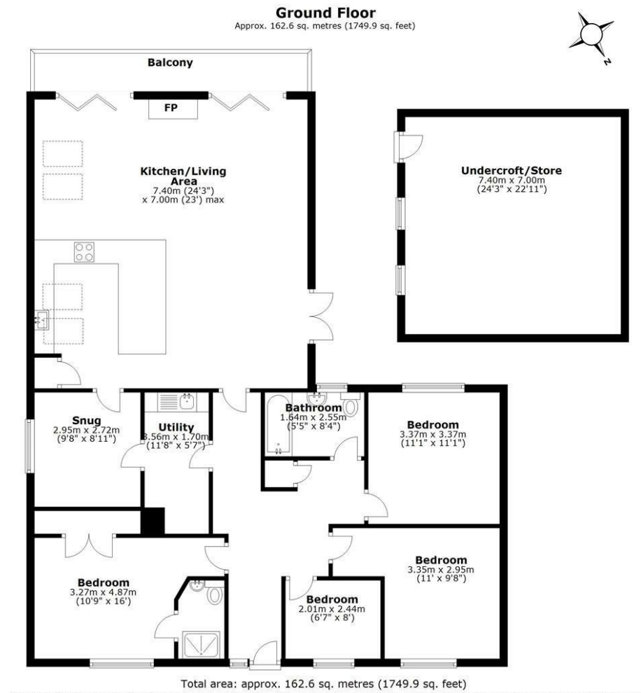
Total area: approx. 162.6 sq. metres (1749.9 sq. feet) Whilst every attempt has been made to ensure the accuracy of the floorplan contained here, measurements of doors, windows, rooms and any other items are approximate and no responsibility is taken for any error, omission or mis-statement. This plan is for illustration purposes only and should be used as such. Plan produced using Planip