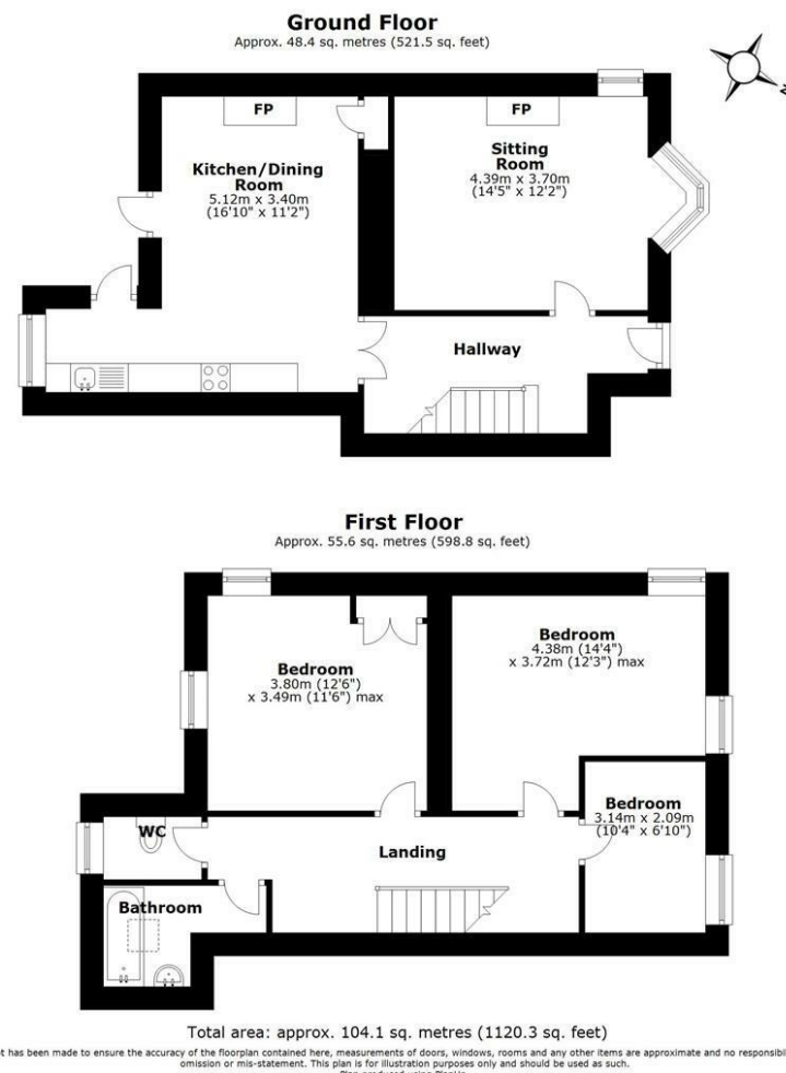
26 Fore Street, Tregony