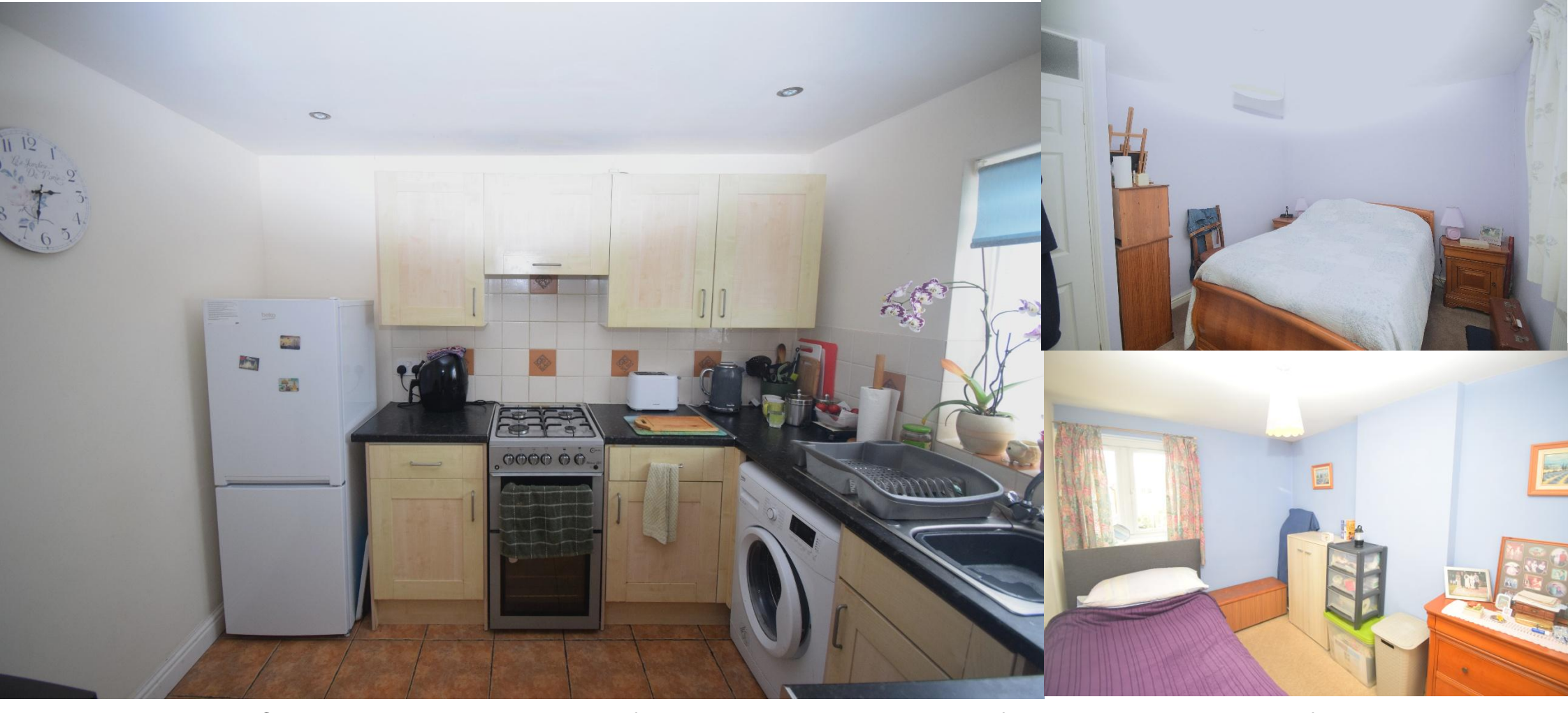
Marina Row, Colley Lane is situated within a mile of the local shops with a wider range of amenities in the town centre of Bridgwater.

Bridgwater is an emerging town situated in the heart of the borough of Sedgemoor and within 11 miles of Taunton and 38 miles of Bristol. The town which is famed for its annual carnival is a thriving place with many new jobs being created in recent years. For more information or an appointment to view please contact the vendors sole agents