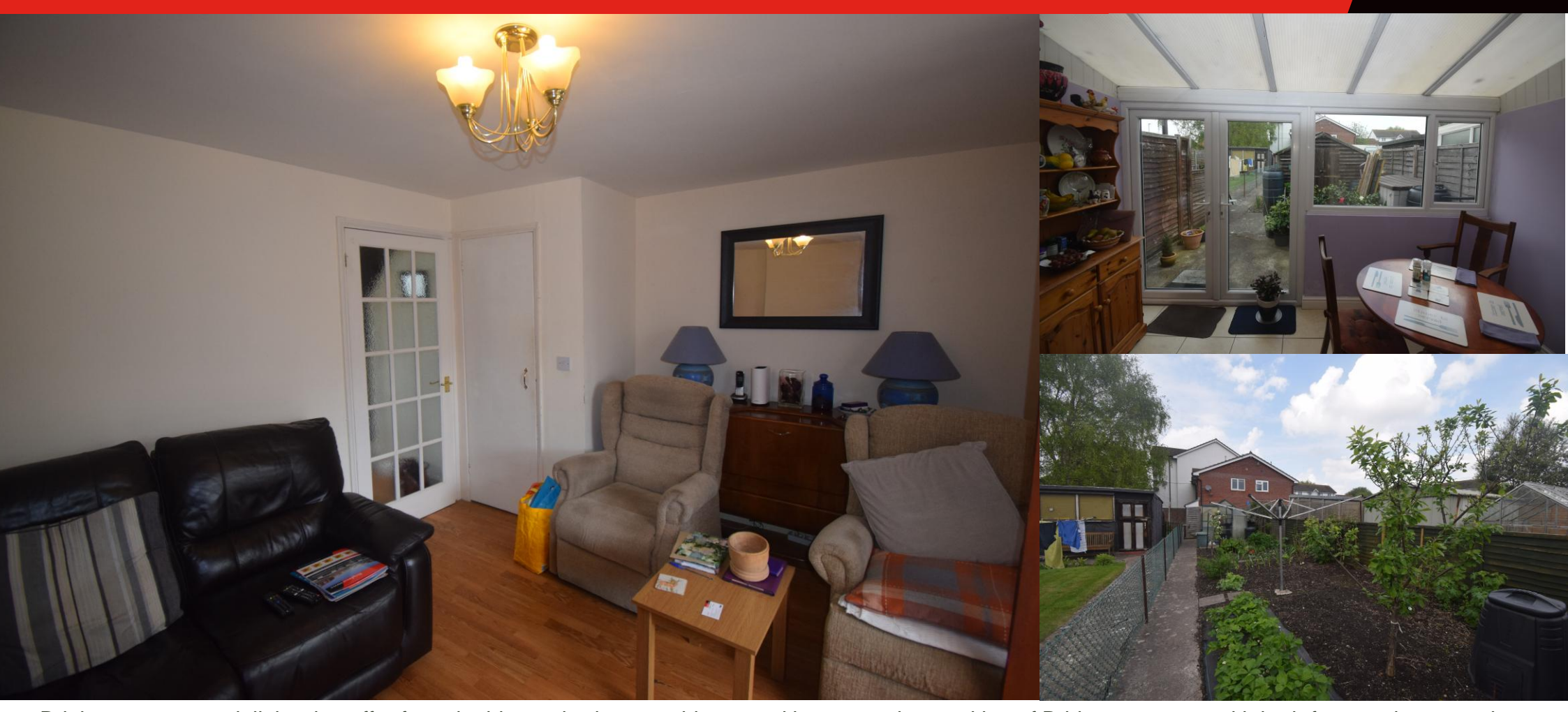
Brightestmove are delighted to offer for sale this two bedroom, mid terraced house on the outskirts of Bridgwater town, with both front and rear garden, within walking distance to town.

Equipped with double glazed windows throughout, this property also benefits from a sun room on the rear of the property. With two good size bedrooms, modern bathroom with walk in shower and downstairs w/c, this property has gas central heating.