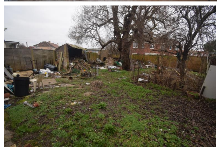
Bridgwater is an emerging town situated in the heart of the borough of Sedgemoor and within 11 miles of Taunton and 38 miles of Bristol. The town which is famed for its annual carnival is a thriving place with many new jobs being created in recent years.

For more information or an appointment to view please contact the vendors sole agents