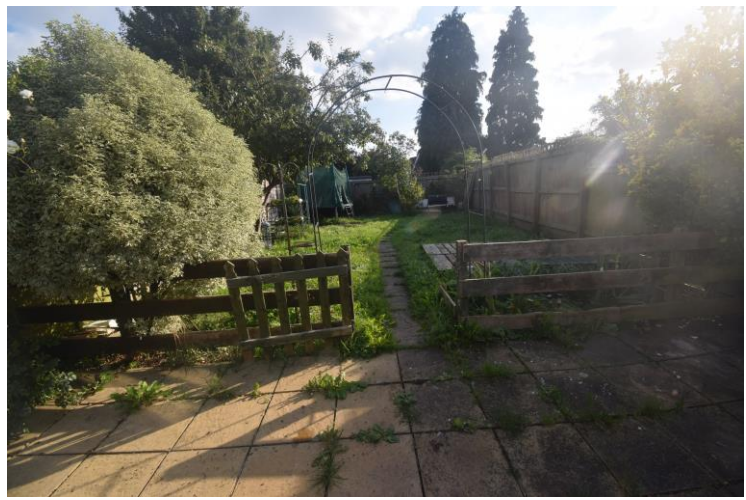
Bridgwater is an emerging town situated in the heart of the borough of Sedgemoor and within 11 miles of Taunton and 38 miles of Bristol. The town which is famed for its annual carnival is a thriving place with many new jobs being created in recent years. For more information or an appointment to view please contact the vendors sole agents.

SERVICES: Mains gas, electricity, water and drainage HEATING: Gas fired central heating system