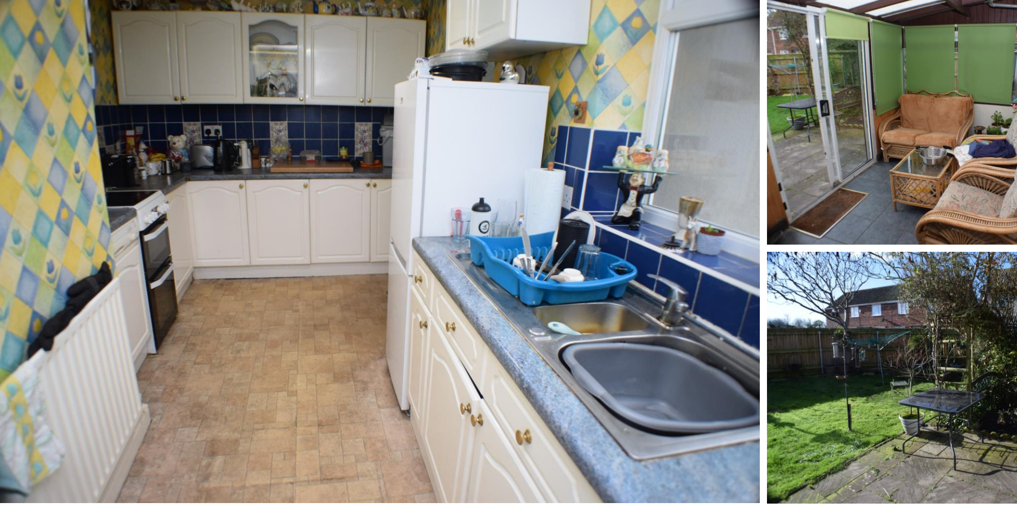
The village of Chilton Trinity benefits from its own church and village hall and is within close proximity to Chilton Trinity secondary school. For more information or an appointment to view please contact the vendors sole agents.

SERVICES: Mains electricity, water and drainage HEATING: Solid fuel central heating system and electric radiator.