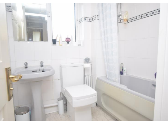
Bridgwater is an emerging town situated in the heart of the borough of Sedgemoor and within 11 miles of Taunton and 38 miles of Bristol. The town which is famed for its annual carnival is a thriving place with many new jobs being created in recent years. For more information or an appointment to view please contact the vendors sole agents.

HEATING: Gas fired central heating system SERVICES: Mains gas, electricity, water and drainage