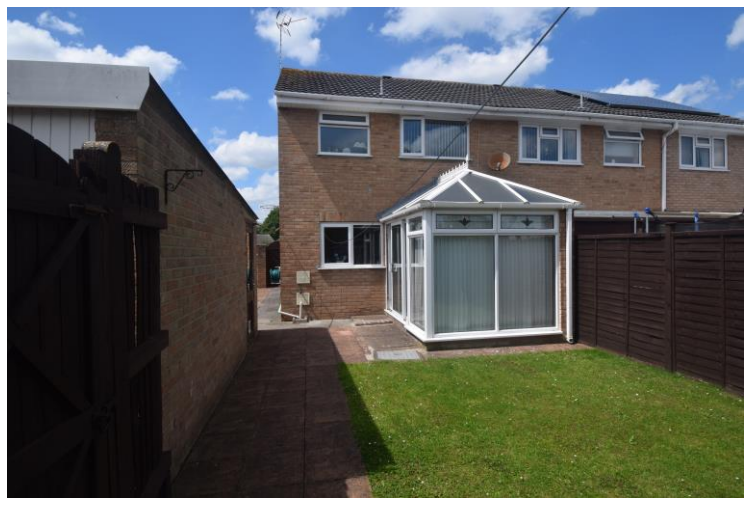
Bridgwater is an emerging town situated in the heart of the borough of Sedgemoor and within 11 miles of Taunton and 38 miles of Bristol. The town which is famed for its annual carnival is a thriving place with many new jobs being created in recent years. For more information or an appointment to view please contact the vendors sole agents.

HEATING: Gas fired central heating system SERVICES: Mains gas, electricity, water and drainage