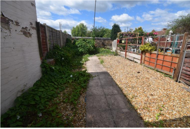
Bridgwater is an emerging town situated in the heart of the borough of Sedgemoor and within 11 miles of Taunton and 38 miles of Bristol. The town which is famed for its annual carnival is a thriving place with many new jobs being created in recent years. For more information or an appointment to view please contact the vendors sole agents.

SERVICES: Mains gas, electricity, water and drainage HEATING: Gas fired central heating system. (Not tested)