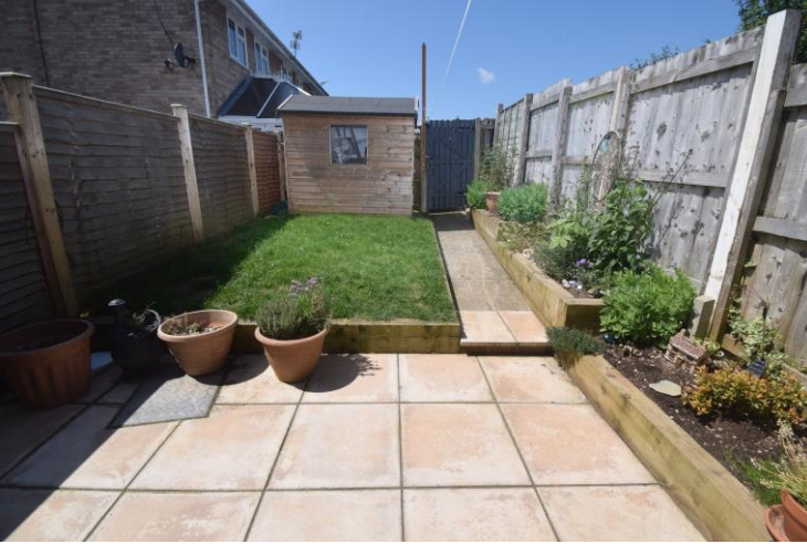
Bridgwater is an emerging town situated in the heart of the borough of Sedgemoor and within 11 miles of Taunton and 38 miles of Bristol. The town which is famed for its annual carnival is a thriving place with many new jobs being created in recent years. For more information or an appointment to view please contact the vendors sole agents.

SERVICES: Mains gas, electricity, water and drainage HEATING: Gas fired central heating system.