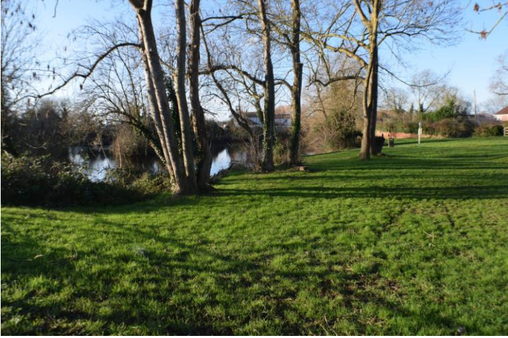
Bridgwater is an emerging town situated in the heart of the borough of Sedgemoor and within 11 miles of Taunton and 38 miles of Bristol. The town which is famed for its annual carnival is a thriving place with many new jobs being created in recent years. For more information or an appointment to view please contact the vendors sole agents.

SERVICES: Mains gas, electricity, water and drainage HEATING: Gas fired central heating system