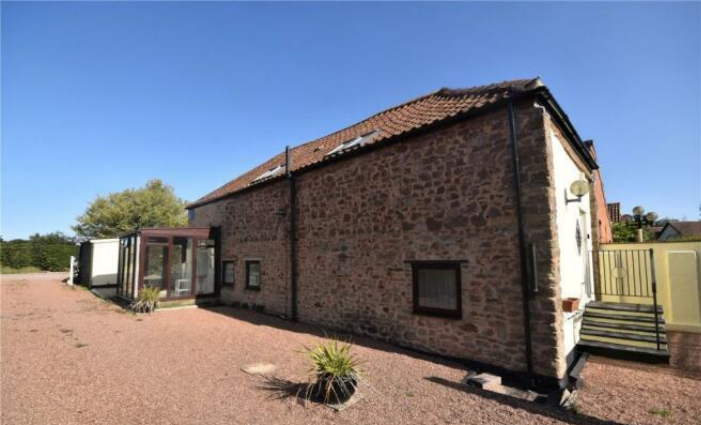
Little Manor Barn Fiddington, Somerset, TA5 1JQ