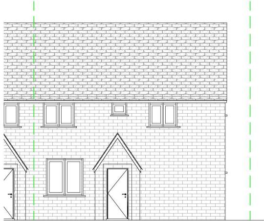
PROPOSED FRONT ELEVATION Scale 1 :150