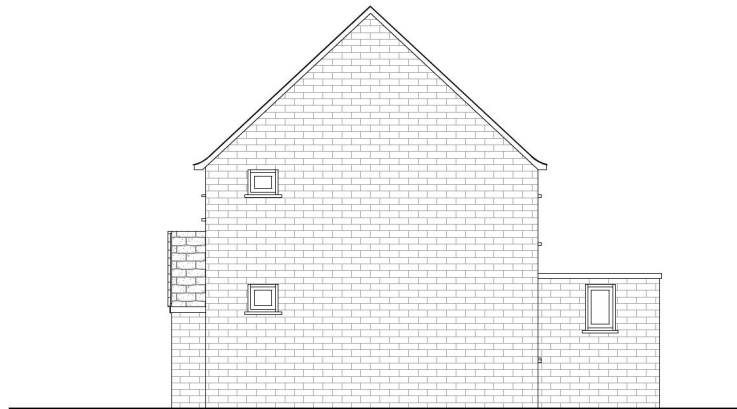
PROPOSED RIGHT ELEVATION Scale 1 :150