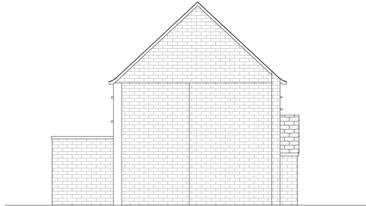
PROPOSED LEFT ELEVATION Scale 1 :150