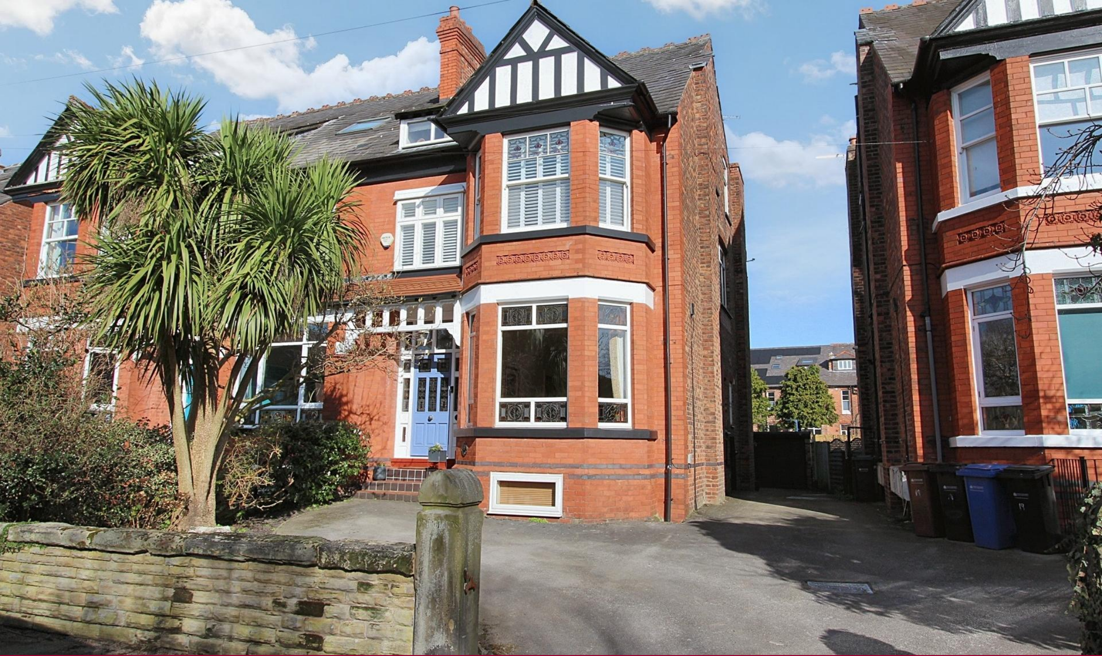
“Craiglands”, 17 Lea Road, Heaton Moor, Stockport, SK4 4JT