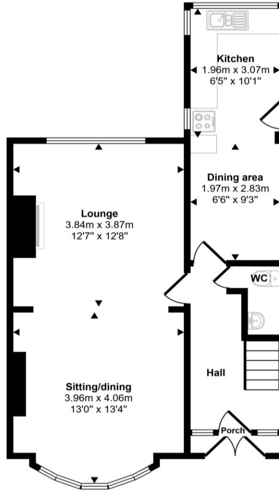
Ground Floor Approx 52 sq m / 564 sq ft

Approx Gross Internal Area 100 sq m / 1072 sq ft