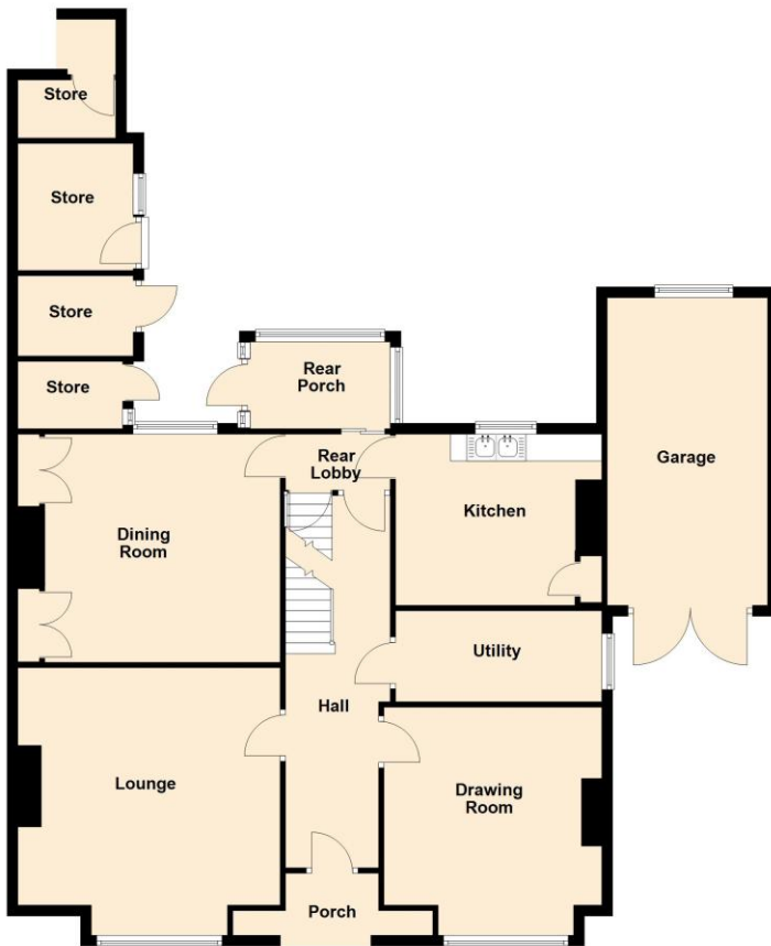
Ground Floor Approx. 138.3 sq. metres (1467.2 sq. feet)