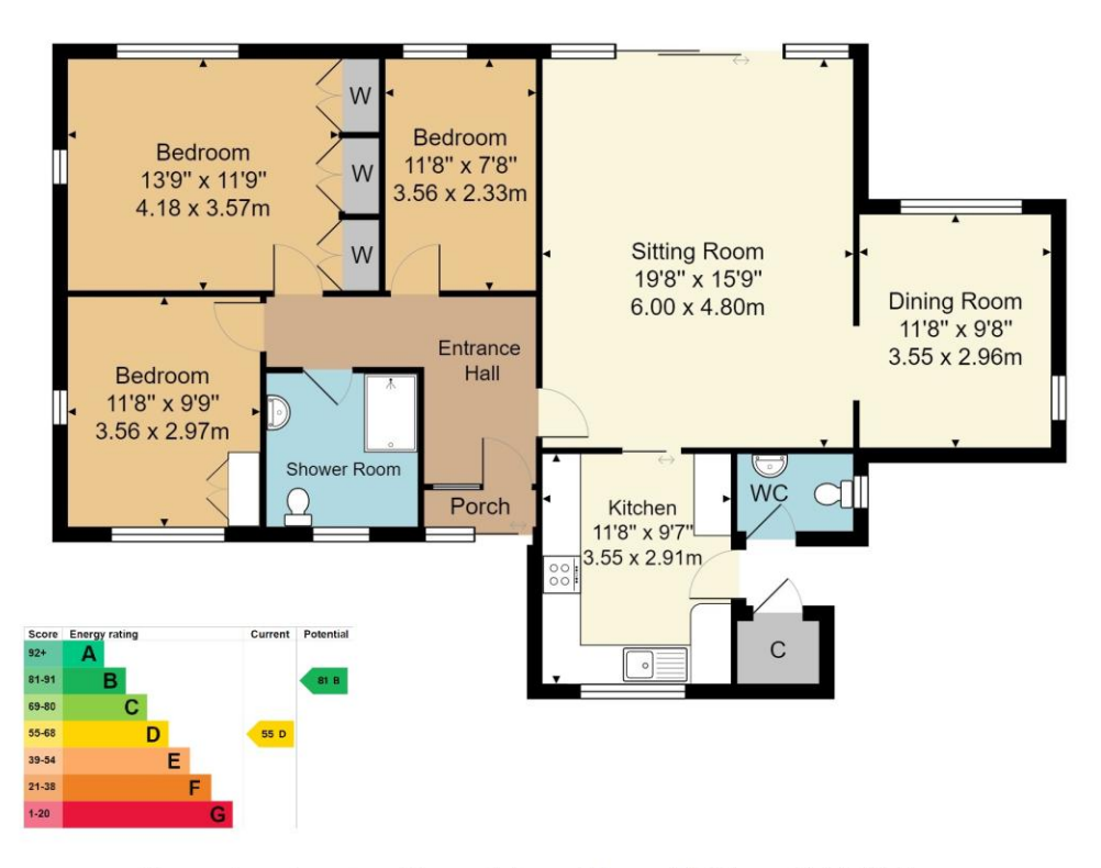
Bungalow Approx. Gross Internal Area 1153 sq. ft / 107.1 sq. m

Whilst every attempt has been made to ensure the accuracy of the floor plan contained here, measurements of doors, windows, rooms and any other items are approximate and no responsibility is taken for any error, omission, or mis-statement. This plan is for illustrative purposes only and should be used as such by any prospective purchaser or tenant. The services, systems and appliances shown have not been tested and no guarantee as to their operability or efficiency can be given.