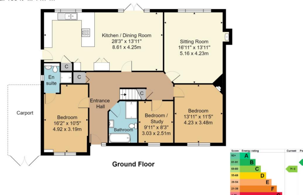
House Approx. Gross Internal Area 2036 sq. ft / 189.2 sq. m

Whilst every attempt has been made to ensure the accuracy of the floor plan contained here, measurements of doors, windows, rooms and any other items are approximate and no responsibility is taken for any error, omission, or mis-statement. This plan is for illustrative purposes only and should be used as such by any prospective purchaser or tenant. The services, systems and appliances shown have not been tested and no guarantee as to their operability or efficiency can be given.