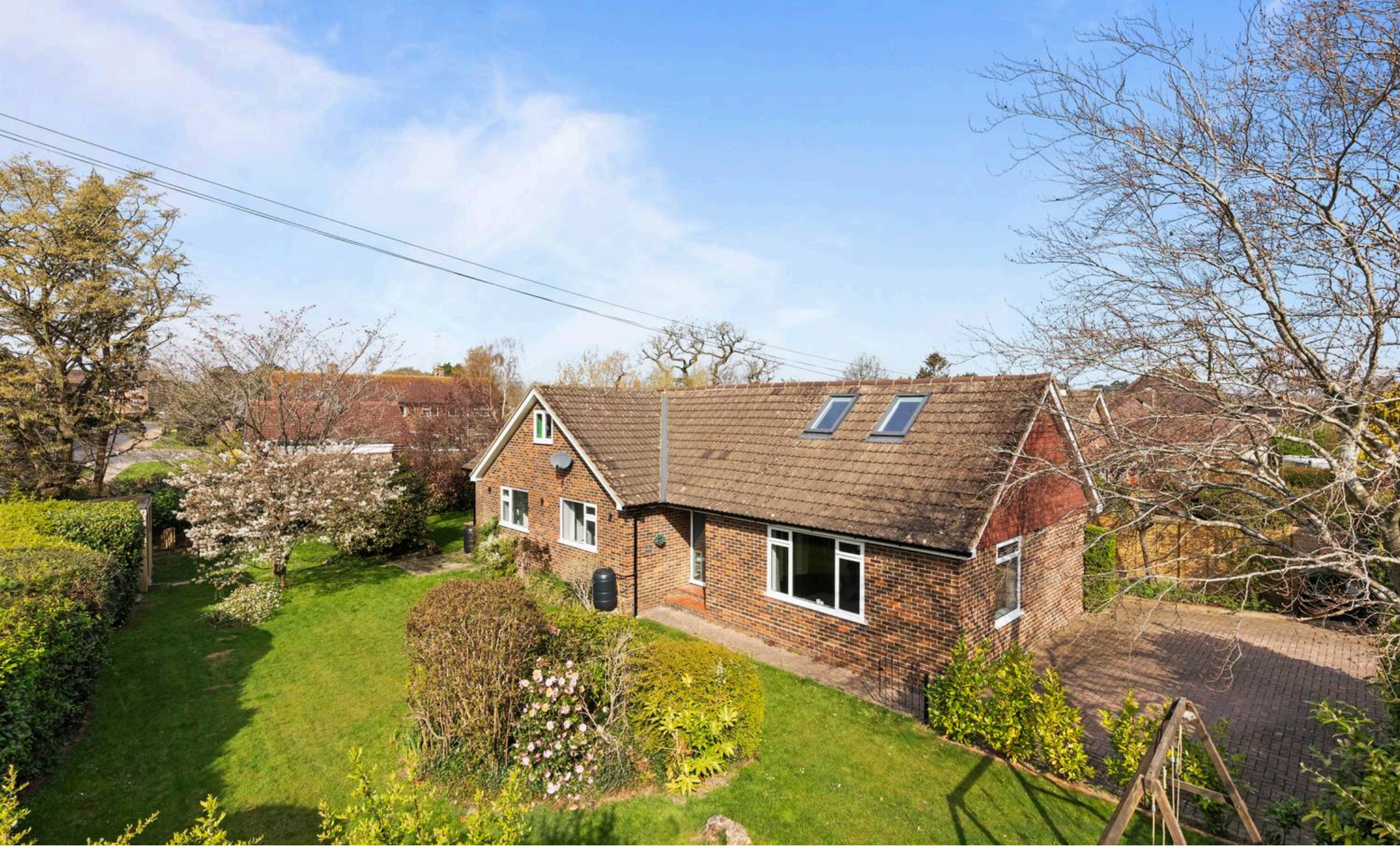
Five Farthings Hengist Close, Horsham, RH12 1SB £730,000