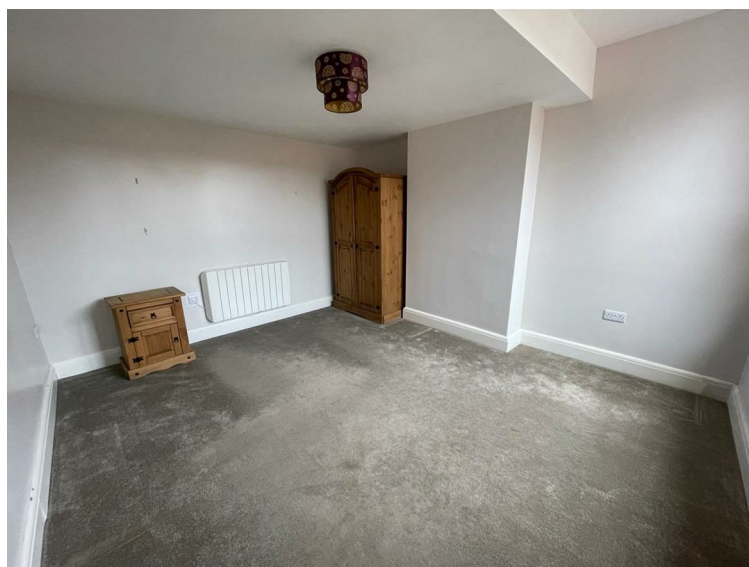
BEDROOM 13'4" x 11'6" (4.08 x 3.53 ) Electric radiator and window to rear elevation: