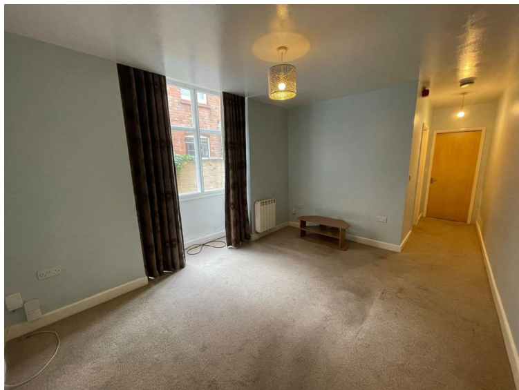
LOUNGE 13'2" x 11'10" (4.03 x 3.61 ) Electric radiator, side bay window: