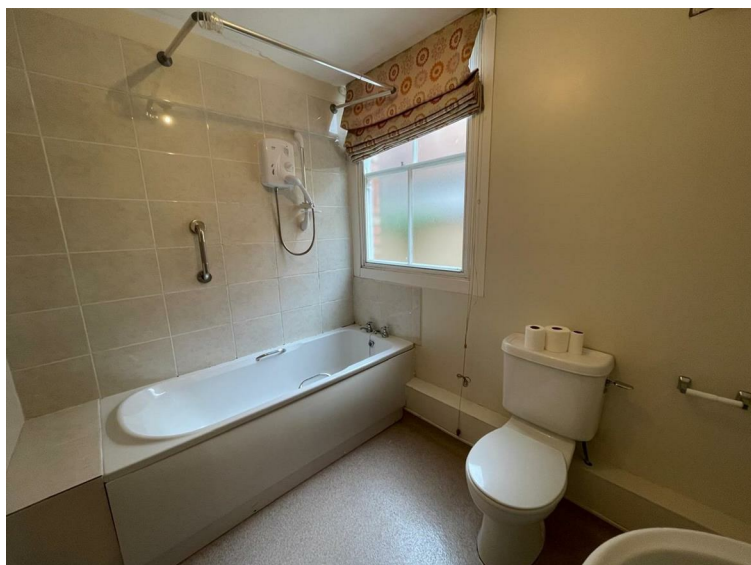
BATHROOM 7'11" x 6'5" (2.43 x 1.96 ) Tiled splashbacks, bath with electric shower over, w/c and pedestal sink. Window to side aspect: