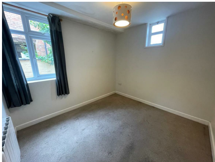
BEDROOM 10'2" x 9'4" (3.12 x 2.86 ) Electric radiator, windows to side and rear aspect: