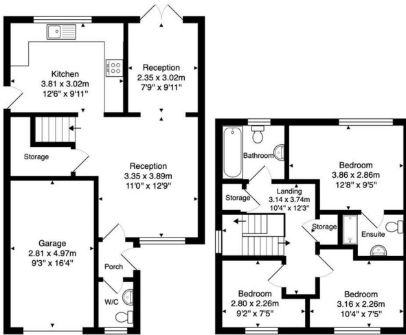
Ground Floor Total Area: 100.4 m² ... 1081 ft² First Floor All measurements and illustrations are approximate and may not be drawn to scale. This floorplan is for display purposes only and all interested parties are advised to make their own independent enquiries. The vendor, agency and supplier will accept no liability for its accuracy.