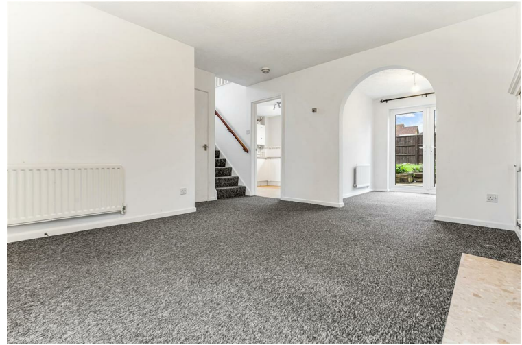
ASPECT TWO FRONT RECEPTION

Entrance via a UPVC front door into an inner hallway with radiator, door to downstairs W/C, door to front reception.