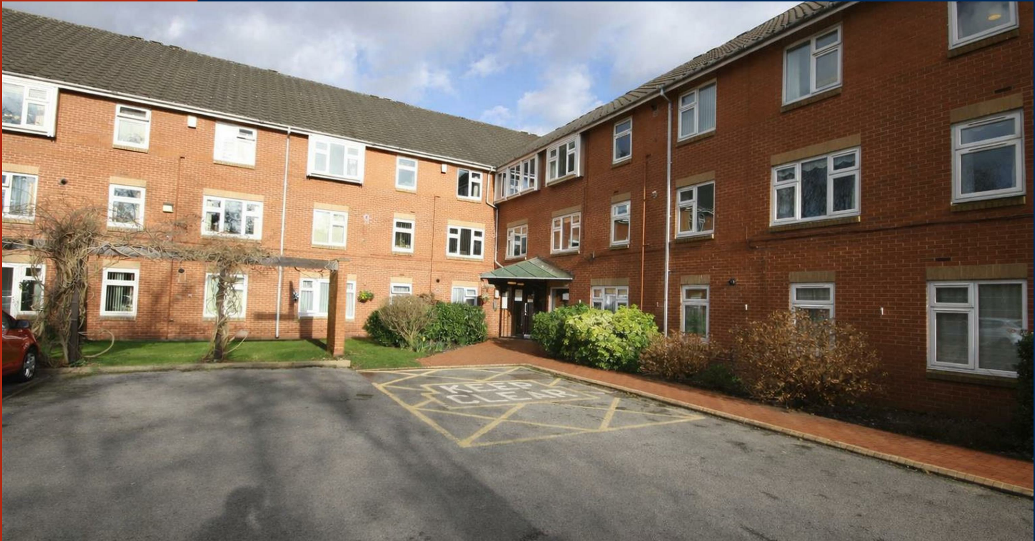
Guardian Court Oakfield, Sale, M33 6WG