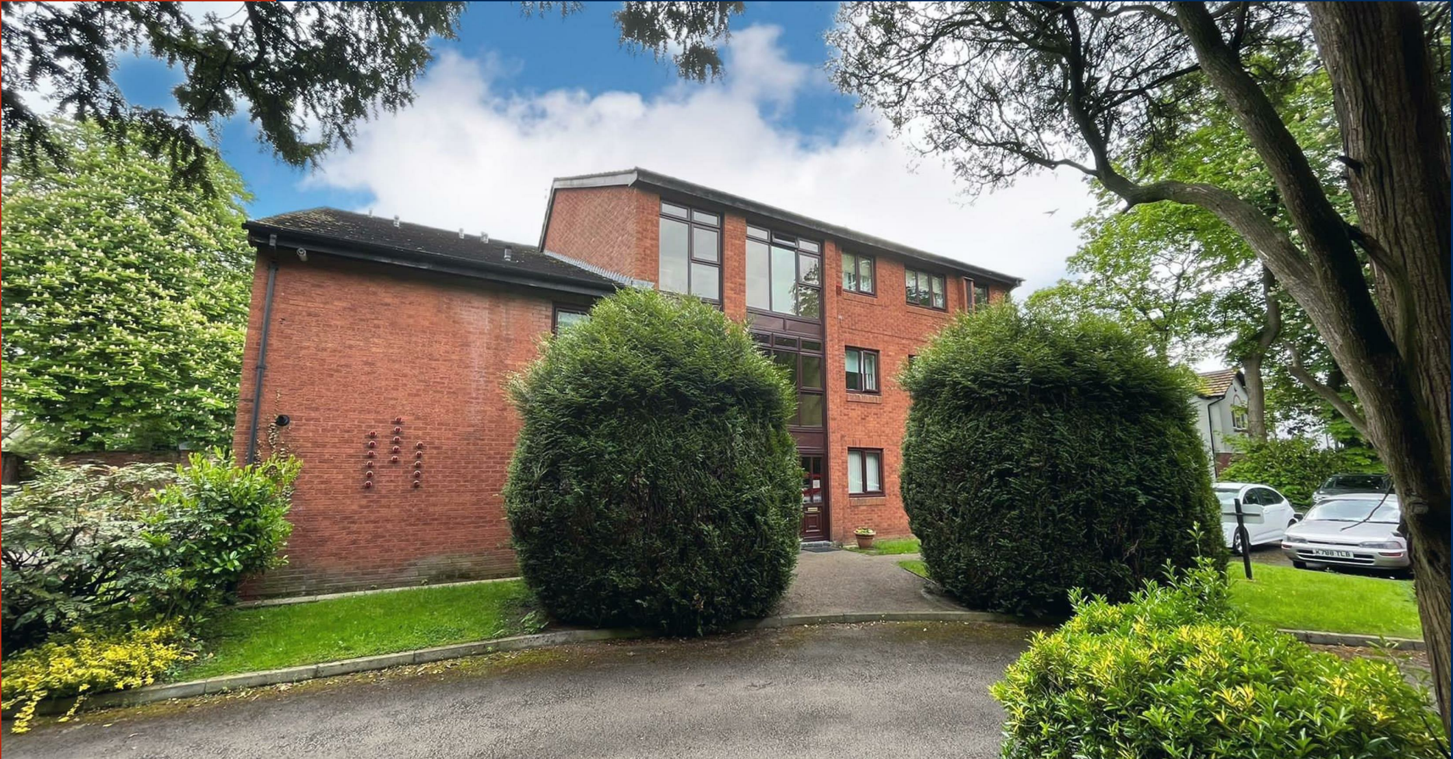
Flat 1 Ellan Brook Lodge, Sale, M33 3PD