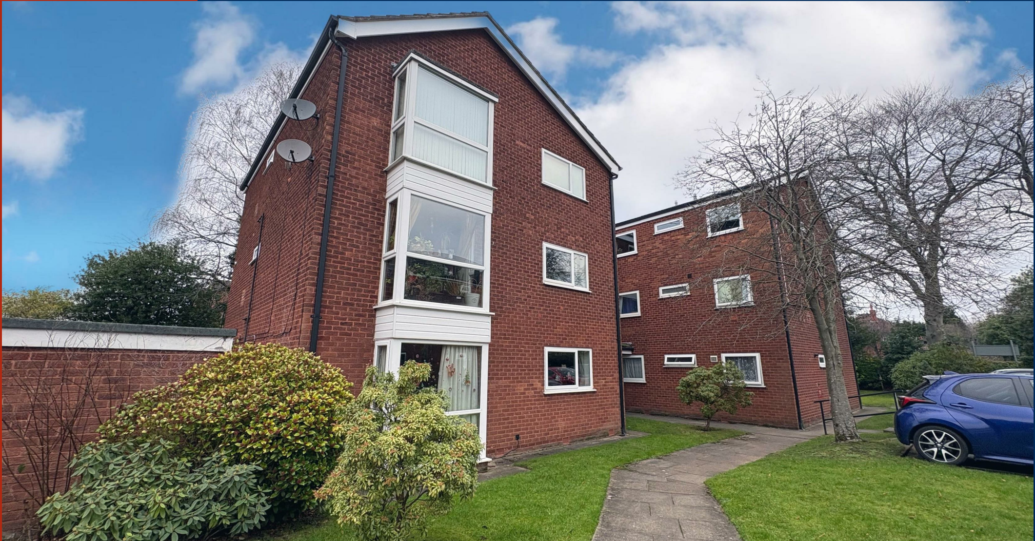
St. Annes Court Northenden Road, Sale, M33 3HB