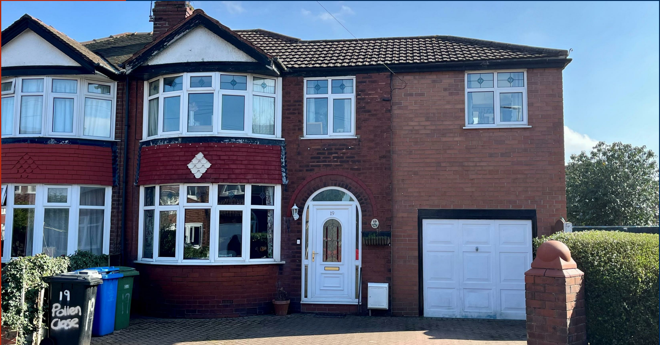
19 Pollen Close, Sale, M33 3LS