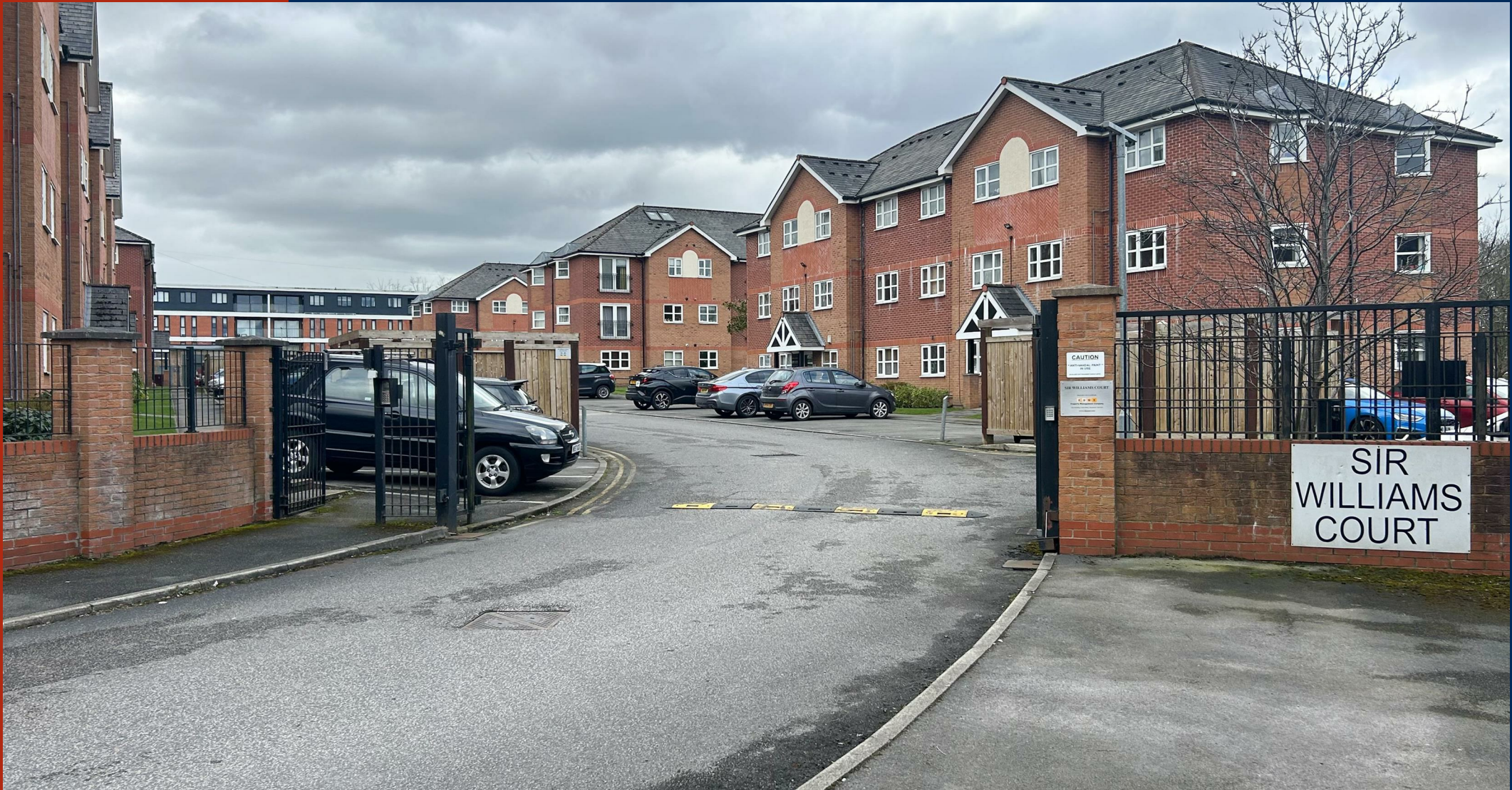
Flat 6 Sir Williams Court, 198 Hall Lane, Manchester, M23