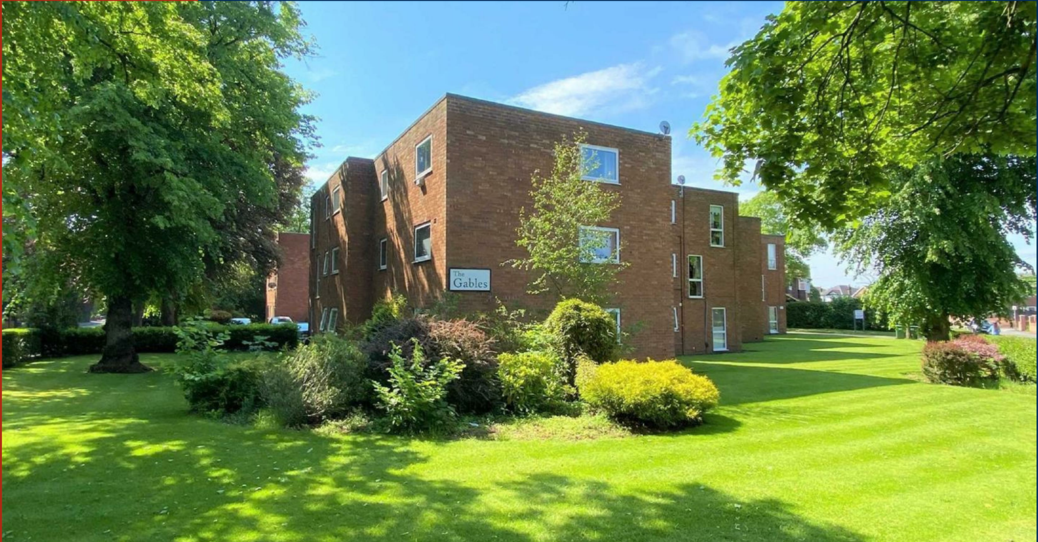
8 The Gables, Brooklands Road, Sale, M33 3SU