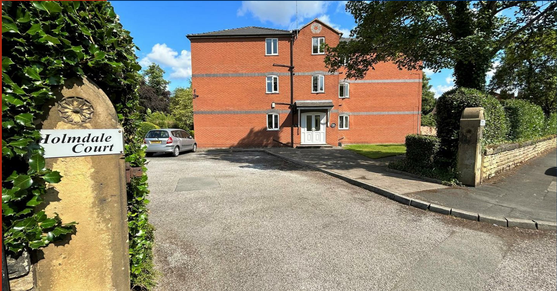
Apt 10 Holmdale Court, Sale, M33 3HB