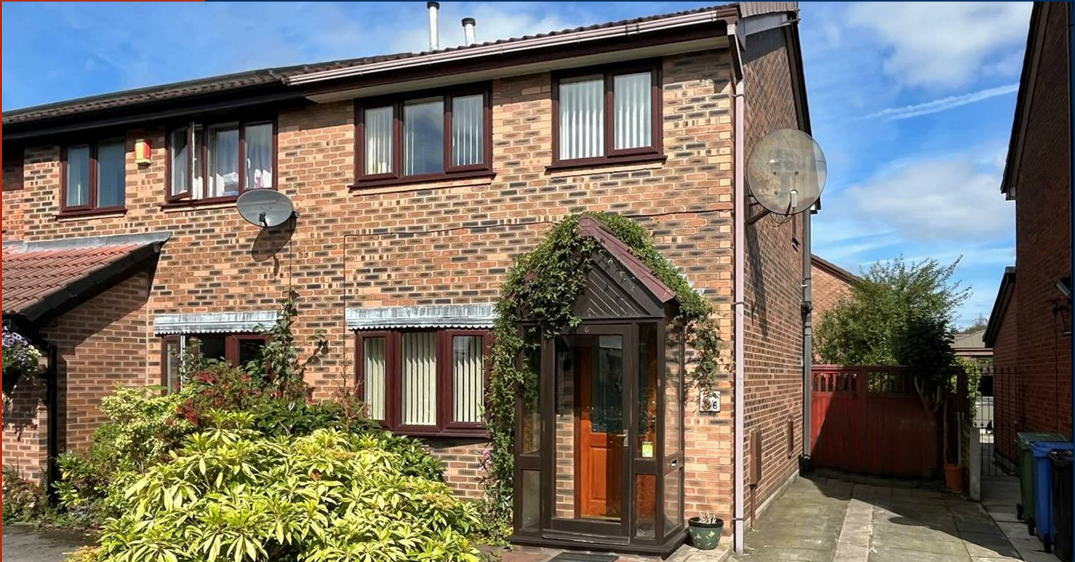
6 Cornfield Close, Sale, M33 2LH