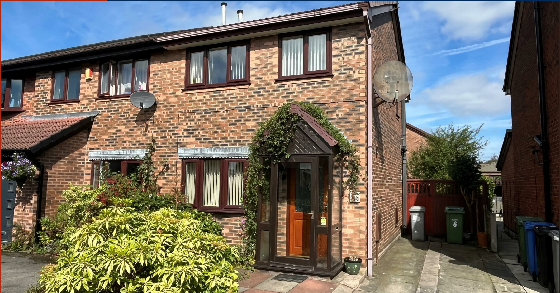
6 Cornfield Close, Sale, M33 2LH