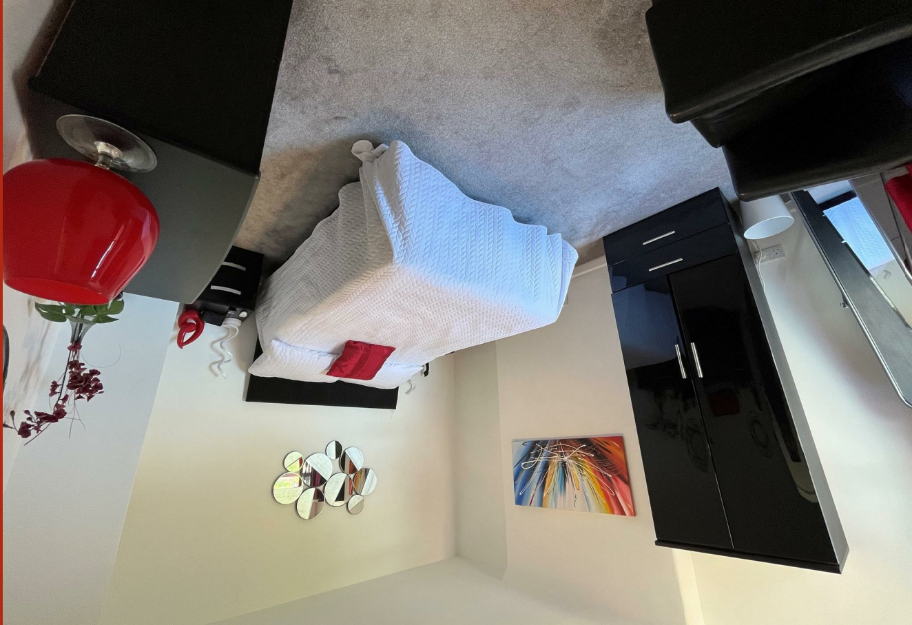
SECOND FLOOR Bedroom Four Externally