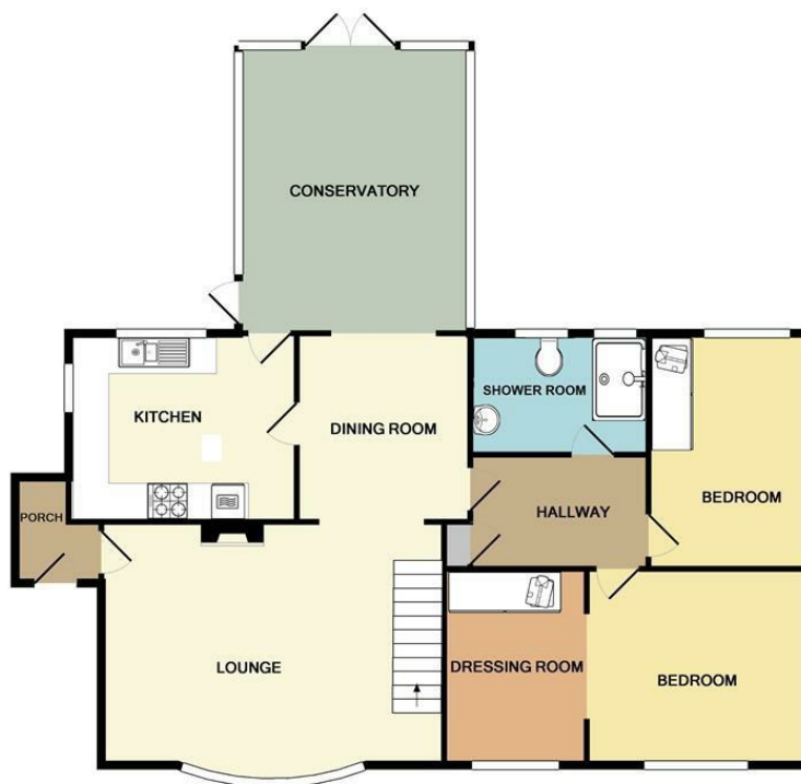
GROUND FLOOR APPROX. FLOOR AREA 1183 SQ. FT. (109.9 SQ. M.)