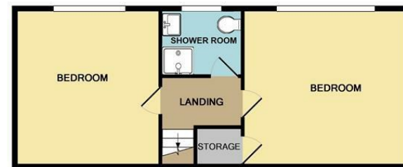
1ST FLOOR APPROX. FLOOR AREA 467 SQ. FT. (43.3 SQ. M.)

TOTAL APPROX. FLOOR AREA 1649 SQ. FT. (153.2 SQ. M.)