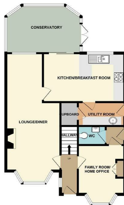
GROUND FLOOR 755 sq.ft. (70.2 sq.m.) approx.