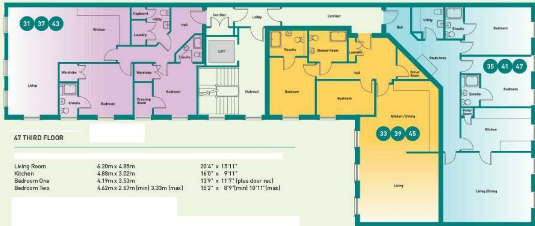
47 THIRD FLOOR