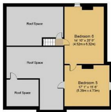
Second Floor Approximate Floor Area 1,437 sq. ft. (133.5 sq. m.)